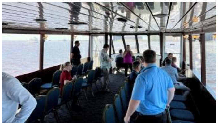
The boat cruise was a chance for networking and educated us on the area's water related transportation and infrastructure