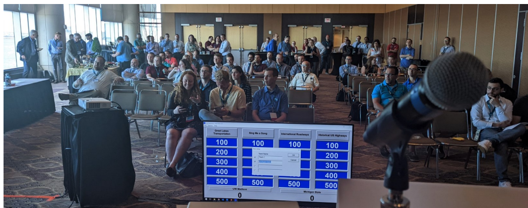
Student's perspective at the 2022 College Bowl Competition - NO PRESSURE!