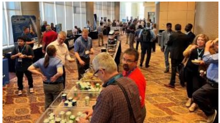
The exhibit hall, a popular spot for networking and learning

I really enjoyed being part of this great group and look forward to seeing everyone at the 2023 Great Lakes District Annual Meeting in Grand Rapids, MI.