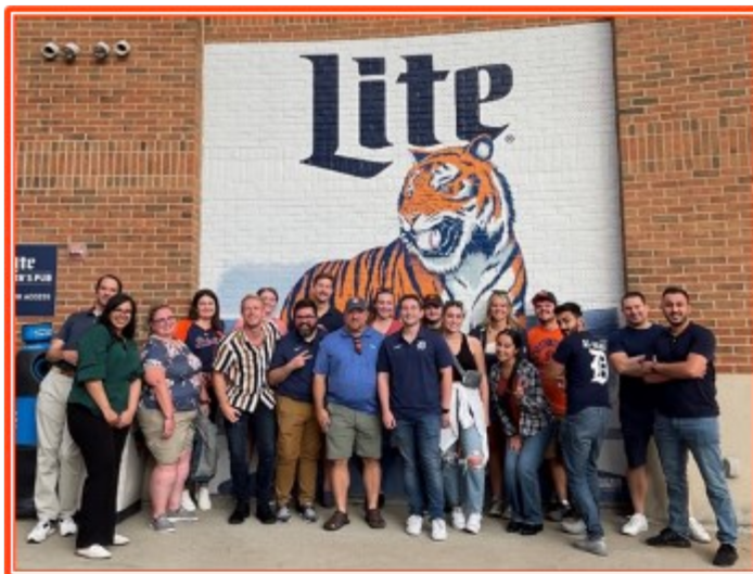
On August 23, ITE Michigan Section attend a Detroit Tigers MLB game organized by the Young Professionals Committee

These events are all possible due to our many committee volunteers and members who contribute to the Technical Sessions, Golf Outings, Social Events, Webinars, and so much more! Thank you, thank you, thank you!