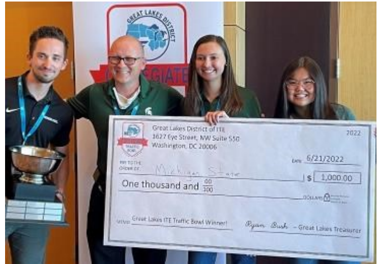
Michigan State wins the ITE District Traffic Bowl