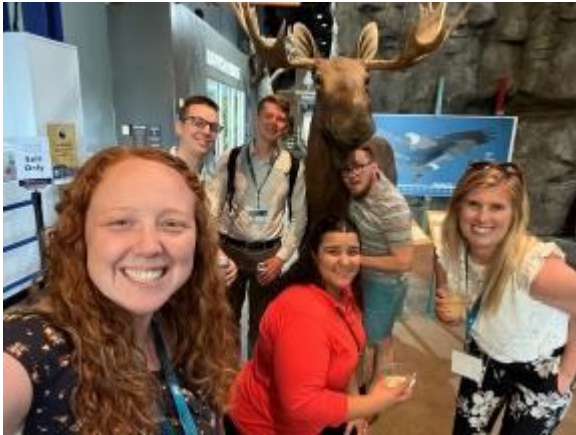
Where else but Duluth for a Moose Selfie!