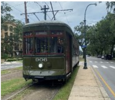
Taking mass transit NOLA style.