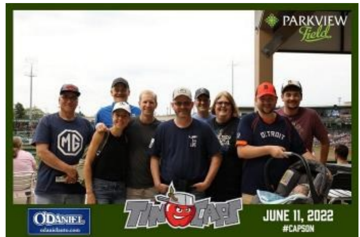
ITE Indiana Section and Indiana DOT staff attend a Fort Wayne TinCaps MiLB game

The Edward J. Cox Memorial Scholarship Golf Outing date has been set for September 22, 2022 at 11:00 am. The outing will be held at Bear Slide Golf Club, 6770 East 231st Street in Cicero, Indiana. Box Lunch at the tee with shot gun start at 12:30. Create a foursome or register individually by visiting indianaite.org . Money raised at this event contributes to scholarships given each spring at Purdue Road School.