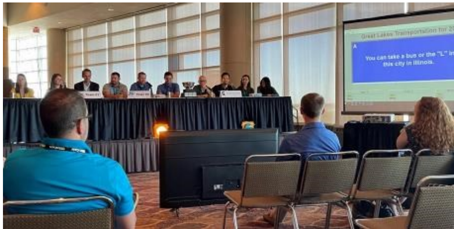
Audience watches Michigan State University and the University of Wisconsin teams compete during the GLITE Traffic Bowl competition