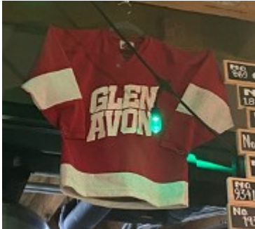
Reliving youth hockey memories in Duluth.

ing to hear how we are continuing to grow around the world. We also approved the International Annual Meeting schedule up to 2030 which awarded the 2028 Annual meeting to Detroit! The IBOD is really excited for Detroit seeing the energy from us, the technical tours with the new projects in the area, and the proximity to our Canadian neighbors to the north. On the financial side, ITE is in a strong position which is a big change from several years ago. This is helping push new initiatives and offerings to our membership like the free webinars and the development of a wiki-type platform for traffic engineering knowledge. Look for more announcements in the future on that last one.