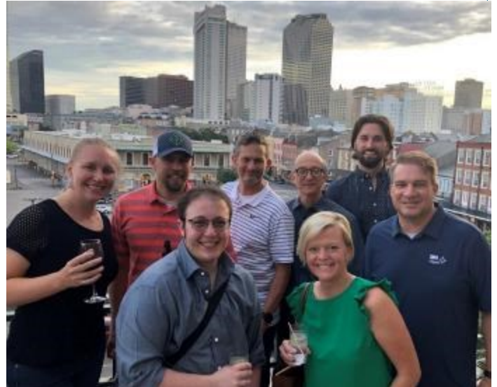
GLITE members from Minneapolis, MN at the closing social at Jax Brewery